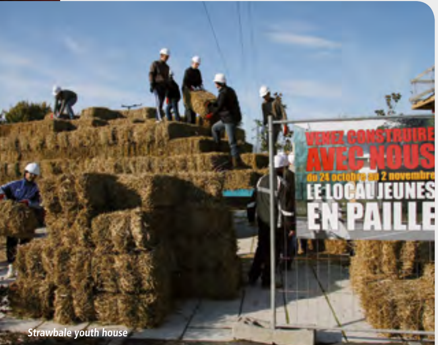
Strawbale youth house

But the council's ambition does not end here. Other projects are in store : new housing development schemes, a long-term health scheme for local businesses, an urban farm project to provide the central kitchen with organic vegetables.