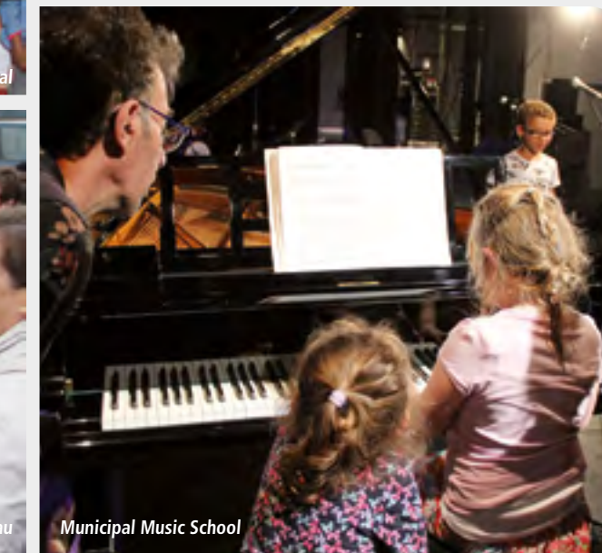
Municipal Music School