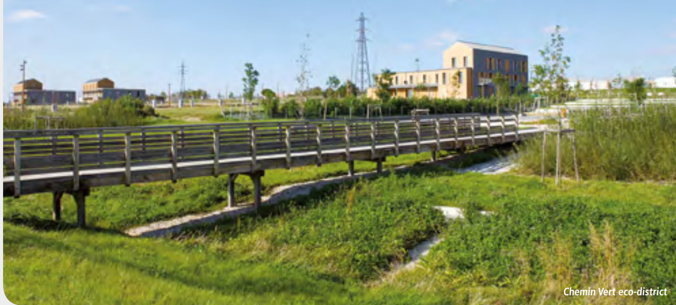
Chemin Vert eco-district

It is the diversity of our experiences which produce meaning and allow for long-term collective action.