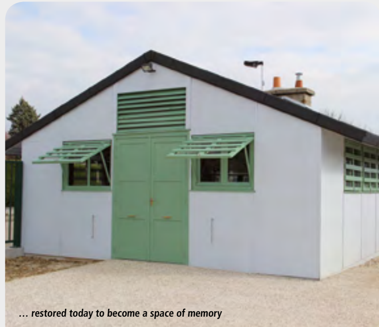
... restored today to become a space of memory

THE WORD OF THE MAYOR & DEPARTMENT CONSELMOR