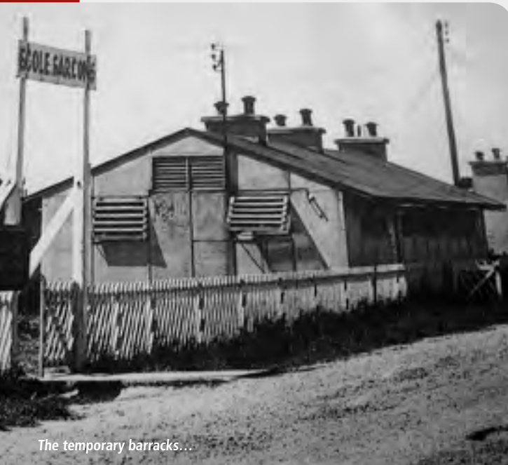
The temporary barracks...

IN THE LATE 19TH CENTURY, GONFREVILLE-L'ORCHER IS BUT A LARGE VILLAGE DESPITE THE PRESENCE OF IMPORTANT WORK PLACES SUCH AS THE BASSOT FOUNDRY AND THE ROPE FACTORY IN THE NEARBY HAMLET OF GOURNAY-EN-CAUX. The Schneider plant layout in Mayville followed by that of the French Refinery Company will come to change the town's landscape and make way for a major bastion of struggle and claim during social movements. Gonfreville l'Orcher is still one of today's french major industrial towns. The end of world war 2 will strike new growth. Overlooking the Seine Estuary, the plateau spawns interest for the american army which sets up transit camps for its GI's in 1944. After departure of the troops, families stricken by Le Havre bombing move into the barracks. In a few months, the population rises from 4440 to 8000. These temporary bunkhouses, lasting until the early 80's, have carved a strong part of the Gonfrevillese identity, made of pugnacity and courage.