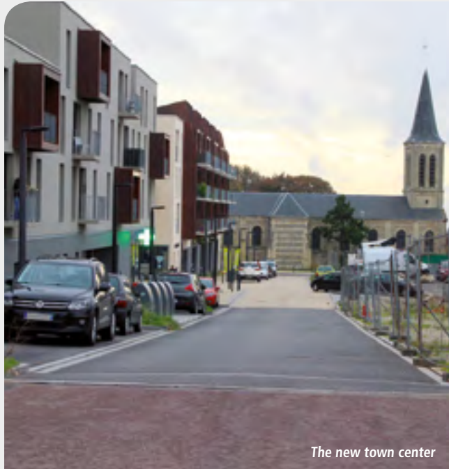
The new town center