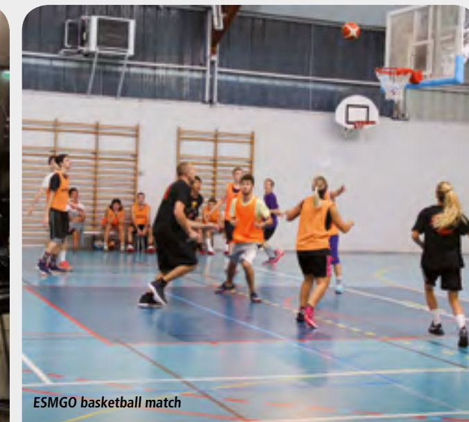
ESMGO basketball match